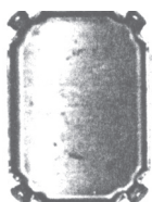
25X18 OCT CB: NR OB: NR