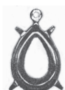
18X13 OB: NR,1R