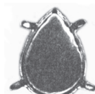
18X13 CB: NR,1R