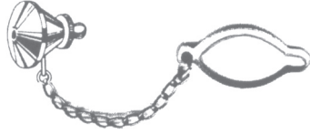
7030 WITH BUTTON SLIDE G&N