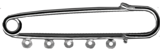
KP 763.5 NICKEL