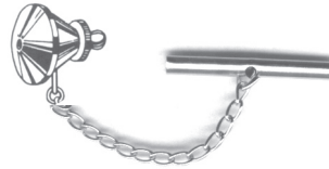
7031 WITH BUTTONHOLE BAR G&N