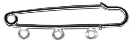
KP 764.3 NICKEL