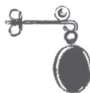
7X5, 8X6 9X7 (SHOWN) 10X8mm BALLDROP G&S